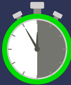
Five minutes' notice