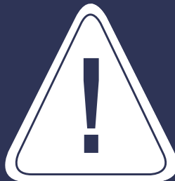
Eight spreadsheet errors