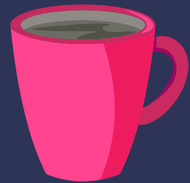
Nine months of stalling