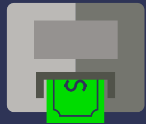
Six divi payments