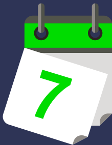
Seven months till July