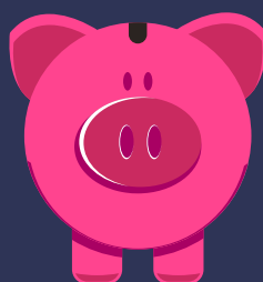
Eleven pension payments