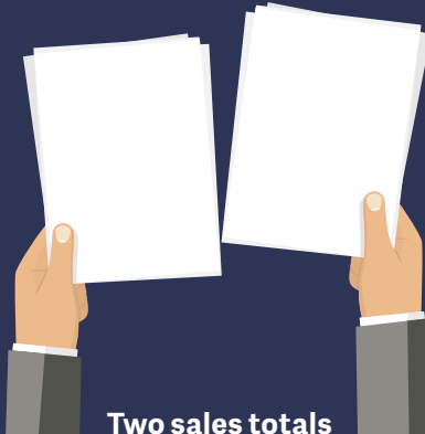
Two sales totals