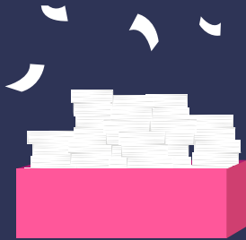
One shoebox full of receipts

We know this is a busy time of year. Click on each of the 12 days of Christmas to learn more about how Sage can help.