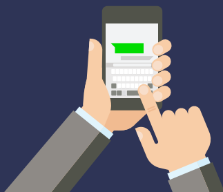
Ten too-fat fingers