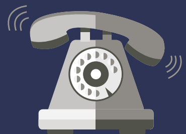
Twelve stressed-out phone calls

At Sage we're always here to help. Speak to our experts on WebChat or call 0845 111 1111