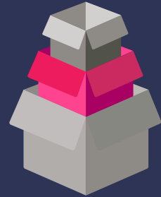
Three forms of income